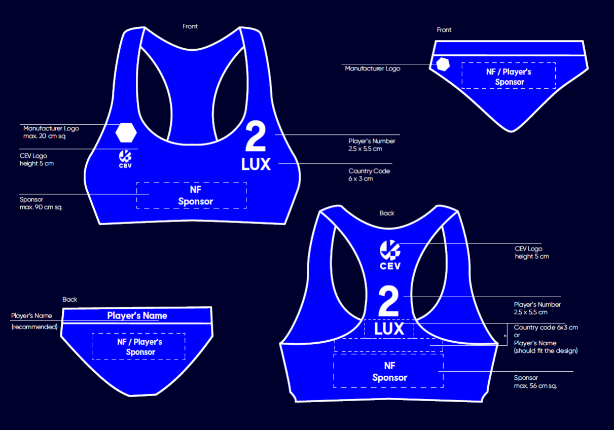
Logos and numbers should be always well visible, and in a contradictory colour to the uniform